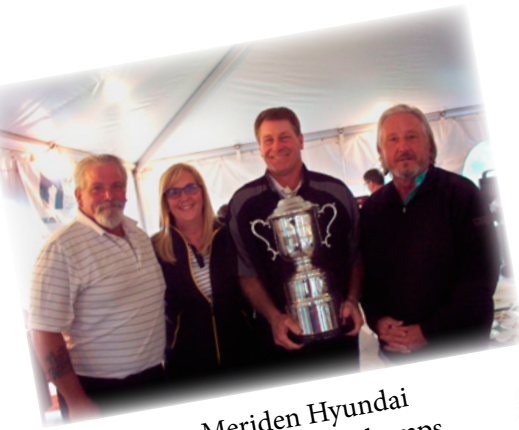
Team Meriden Hyundai 2018 Boardman Cup Champs

Beecher & Bennett Funeral Service Bouvier Insurance The Bradley Home Connecticut Temperature Controls LLC Harry Grodsky & Co., Inc. Ion Bank MembersFirst CT Federal Credit Union Meriden Hyundai MidState Medical Center New England Capital Financial Advisors LLC PROSHRED Security Radio Frequency Systems Westfield Property Group - Westfield Meriden