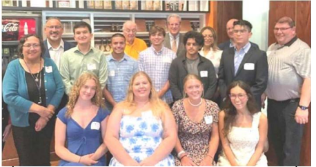
2024 Education Award Winners

On behalf of the Board of Directors, the Golf Committee and Staff of the Chamber, it is our pleasure to welcome you to our 38 th Annual Midstate Chamber of Commerce Golf Tournament . The Ray Parmentier Memorial Classic is named after one of the founders of the tournament who was active on our Golf Committee for MANY years.