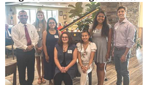
Student Award Winners (2019)

Ray Parmentier Memorial Benefiting Education Awards for Area High School & College Students