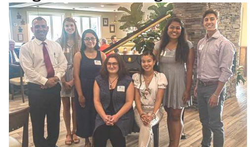
Student Award Winners (2019)

Ray Parmentier Memorial Benefiting Education Awards for Area High School & College Students