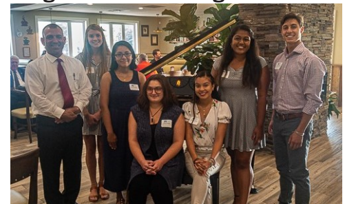
2020 Student Award Winners

Ray Parmentier Memorial Benefiting Education Awards for Area High School & College Students